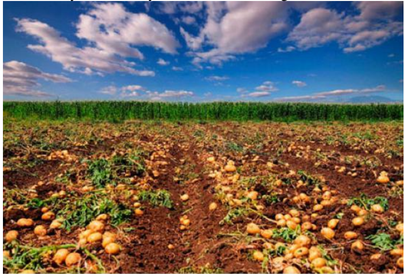
UK Agriculture Products

As we mentioned earlier, the rural sector the economy manages to satisfy most of the needs of the British population in its products. So, oats and barley, potatoes are grown in sufficient quantities. Enough in the country of poultry and eggs, pork, milk of its own production. Beef and veal are produced, but also imported.