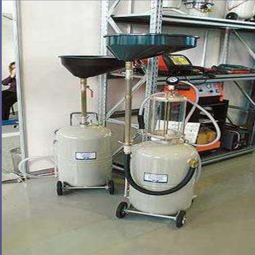
Crankcase oil supercharger